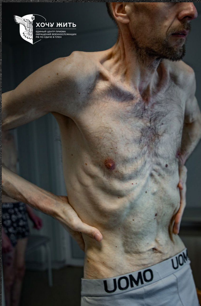
Photo of one of the Ukrainian soldiers released from Russian captivity on May 31, 2024.