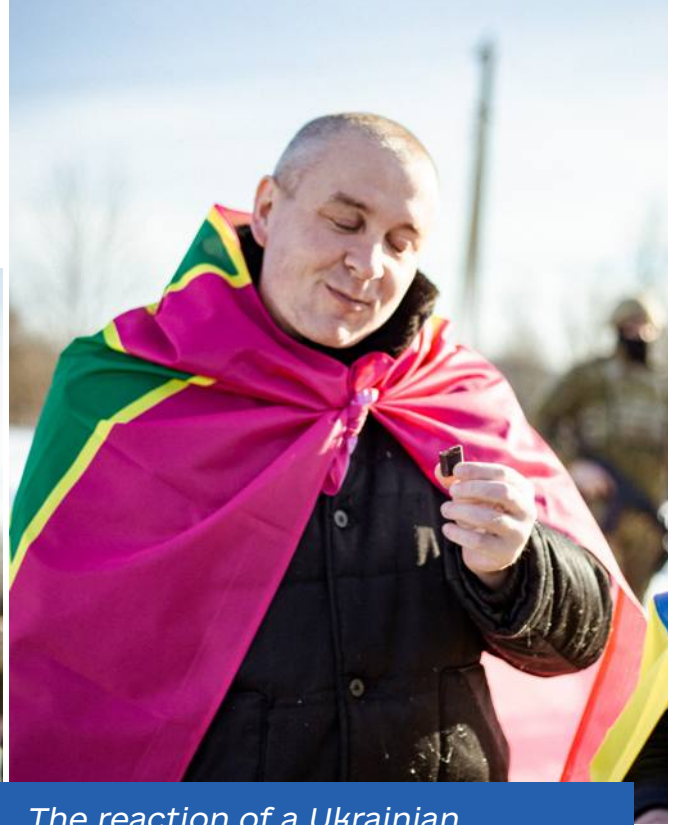
The reaction of a Ukrainian defender returned from captivity after he tasted candy that he had not eaten for about 2 years