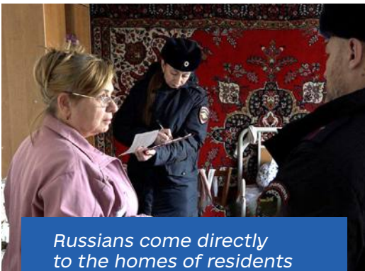
Russians come directly to the homes of residents of the temporarily occupied territories and force them to take Russian passports

Under the threat of deprivation of parental rights, parents are forced to issue Russian documents for their children.